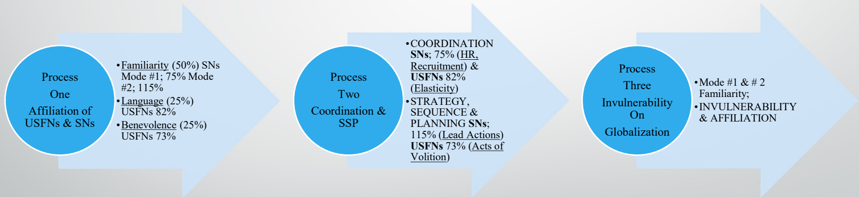
Figure 2; Process Arrows Model: Familiarity Three Process Model & Invulnerability Impacting Globalization